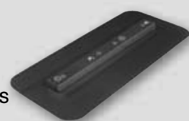
Reversible Finish Blade