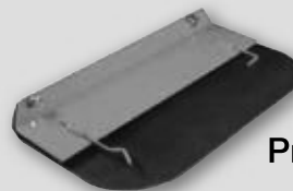
Clip Over Float Blade